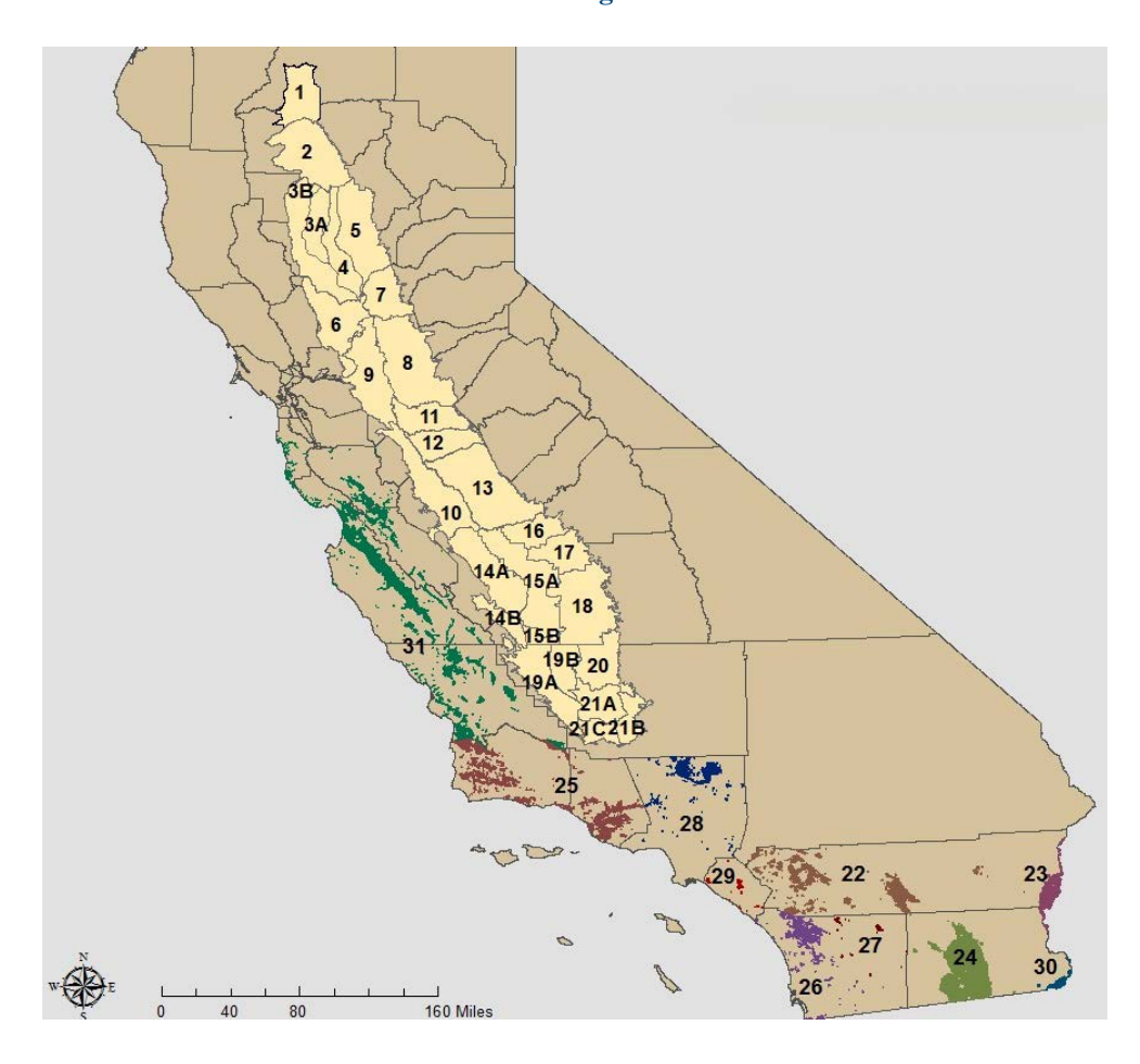
Figure 2: SWAP Regions